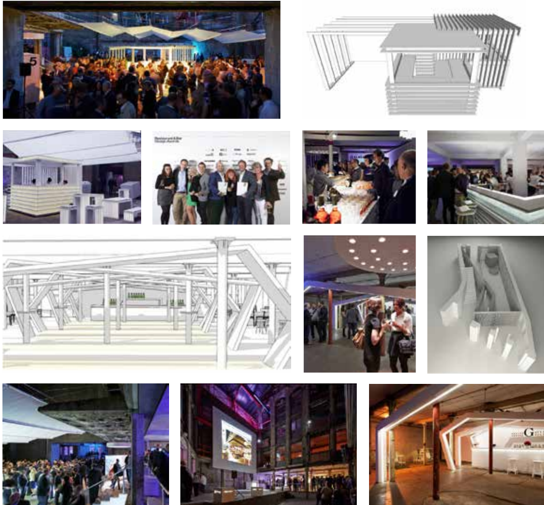
2013 – The Farmiloe Building (The Box Project)