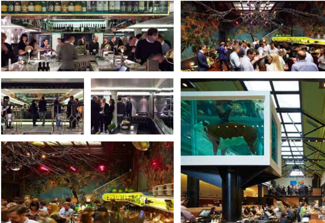
Restaurant & Bar Design Talks events